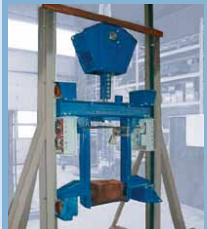
Crosshead with freefall arrestor on testfield

www.ruhrpumpen.com email: info@ruhrpumpen.com