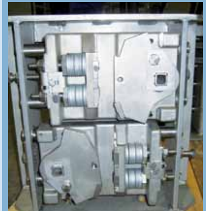
Freefall arrestor detail unit has to be approval with certificate for traveling weight up to 9200kg