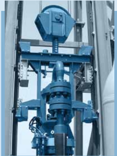
Crosshead with freefall arrestor on installation